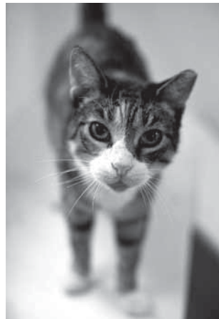
Eleanor, (L) and Scully, (R) are charter members of the Silver Whisker Club! These two represent many dogs and cats that are senior in age, yet healthy, active, and available for adoption.